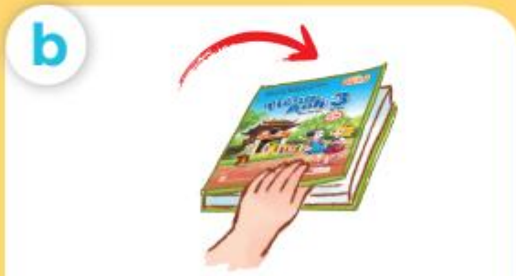
close your book