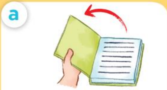
open your book