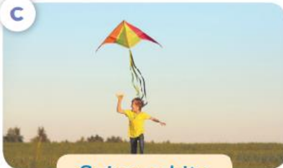
flying a kite